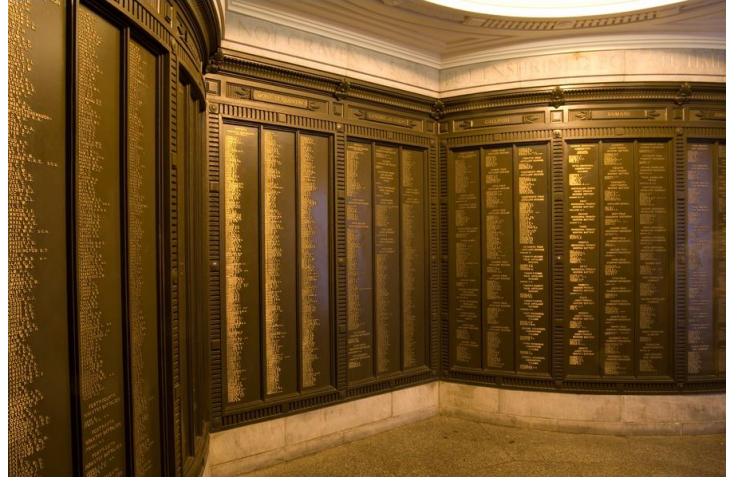
Adelaide National War Memorial