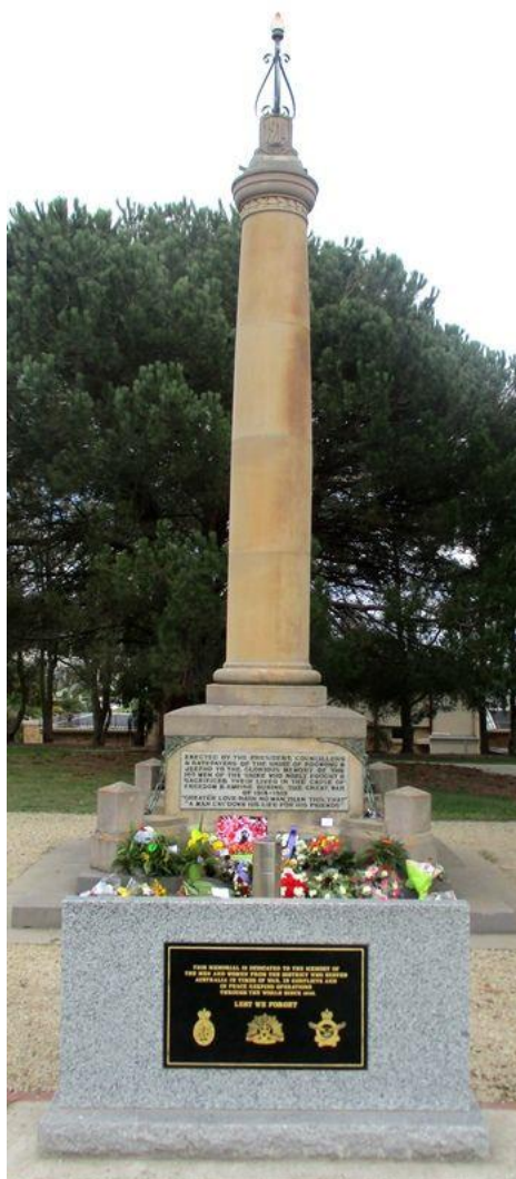
Korumburra War Memorial