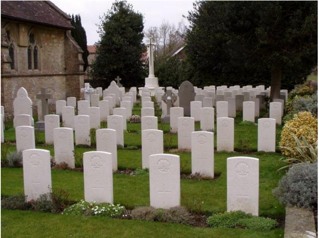
War Graves at Sutton Veny